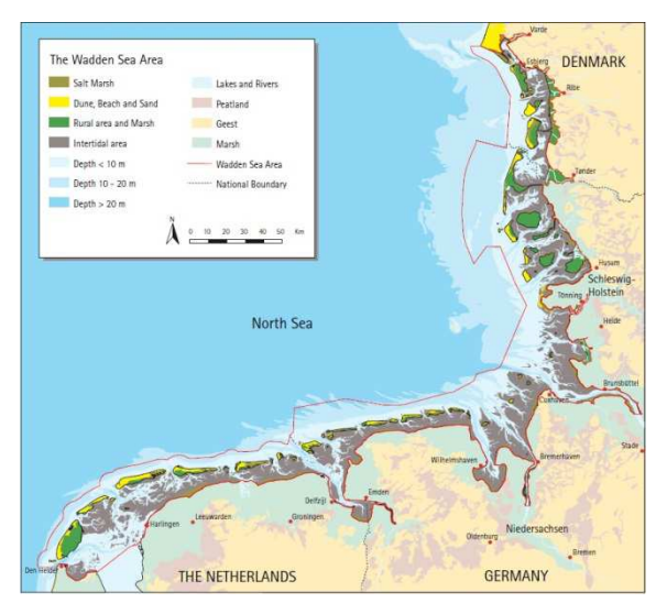
Figure 1 Map of the Wadden Sea

The Trilateral Wadden Sea Cooperation in between Germany, the Netherlands and Denmark is possibly one of the oldest and well established examples of transboundary cooperation wetland for conservation in the world. Indeed, these three sovereign states have entered a formal but not legally binding treaty in order to develop a highly complex level of joint management towards the conservation of the Wadden Sea area. Although these states share a specific common history and political, economic and social contexts relevant to Europe, some lessons can be extracted from their